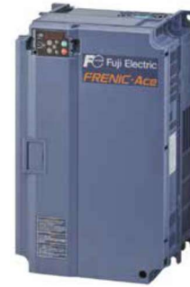
FRENIC – Ace - H