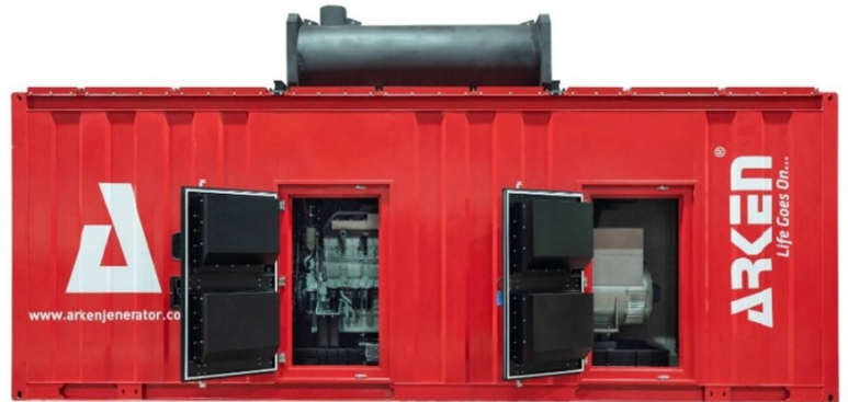
Low Voltage Generator