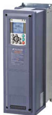
FRENIC – HVAC