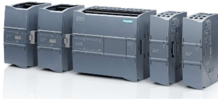
SIMATIC S7 - 1200