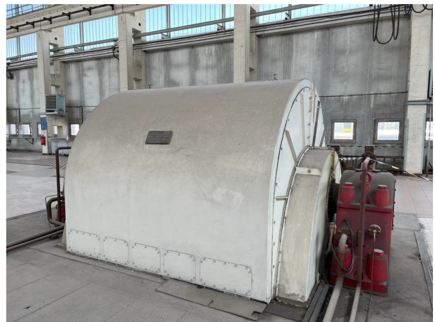
GANZ Synchronous Condenser Machine