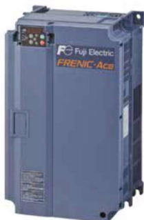
FRENIC – Ace For Solar Pumping