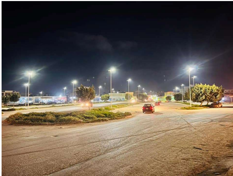
El Marj Municipality – Libya

Esavior Energy Savior, Save Mother Earth