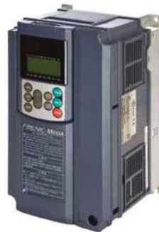
FRENIC - MEGA