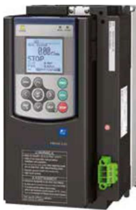
FRENIC - LIFT