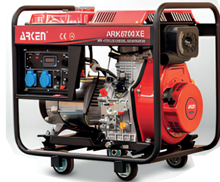
Portable Diesel Low Voltage Generators