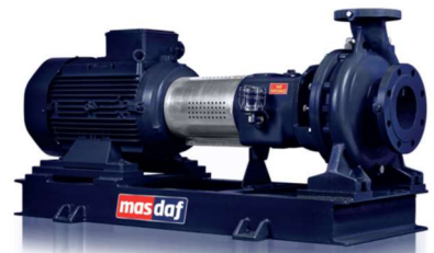
Industrial Electropump Group