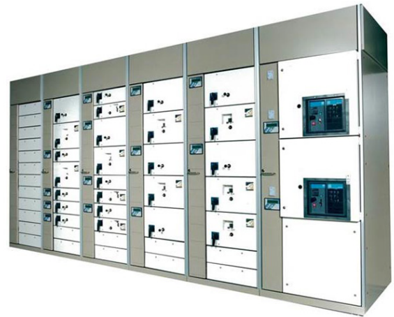
LV Electrical Panel - NORMABLOC