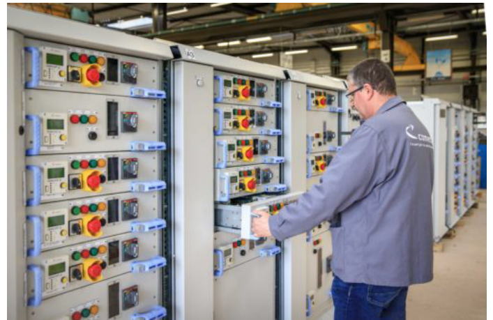
LV Electrical Panel - GALAXIS