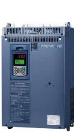
FRENIC - VG