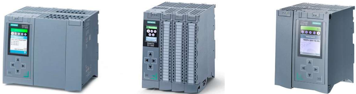
SIMATIC S7 - 1500