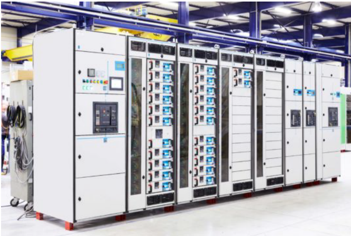
LV Electrical Panel - TITAN