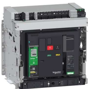
Circuit-breakers MasterPact MTZ