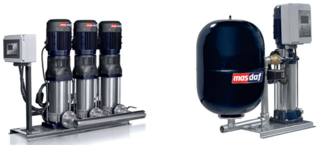
Pressor booster Unit