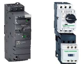
Motor Circuit-breaker contactor