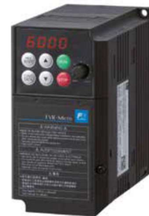
FVR - MICRO